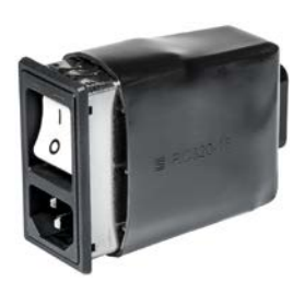
RC320 Rear Cover for Power Entry Module